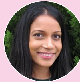
Vallon Children's Centre Manager