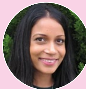
Vallon Children's Centre Manager