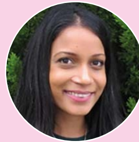
Vallon Children's Centre Manager