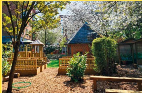
Brook Green Family Centre 49 Brook Green | London W6 7BJ T: 020 7605 0800 | E: vallon@upg.org.uk

All areas of the programme cover the: EARLY YEARS FOUNDATION STAGE