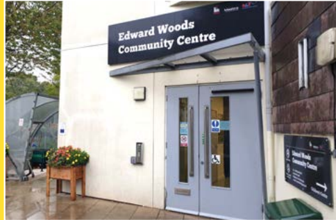
Edward Woods Community Centre 60-70 Norland | London W11 4TX T: 020 7605 0800 | E: vallon@upg.org.uk