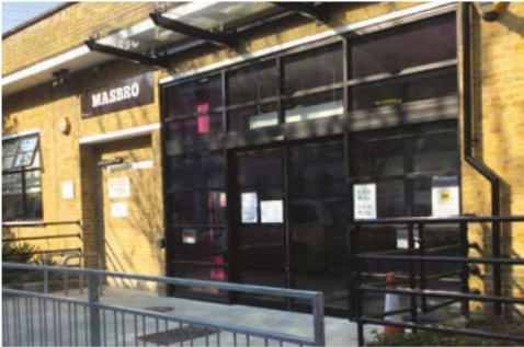
Masbro Children's Centre Milson Rd entrance | 87 Masbro Rd | W14 0LR T: 020 7605 0800 | E: vallon@upg.org.uk